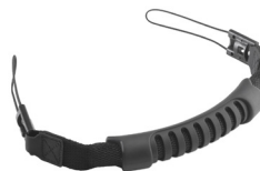
DELL NYLON HANDLE

Carry your rugged laptop with the rigid handle that attaches easily and securely.