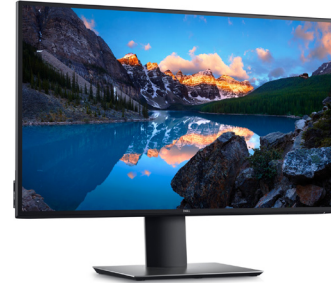
DELL U2720Q - 4K USB-C MONITOR

The world's most powerful and first modular Thunderbolt dock with a future-ready design.