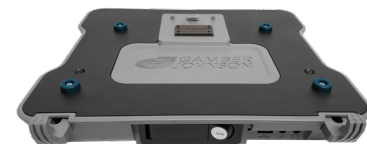
GAMBER-JOHNSON VEHICLE DOCK

Outfit your entire fleet of vehicles with a single docking solution. Adjusts to fit your vehicle space with a full suite of mounting options.