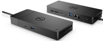
DELL THUNDERBOLT DOCK - WD19TBS

The world's most powerful and first modular Thunderbolt dock with a future-ready design.