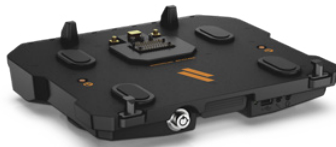
HAVIS VEHICLE DOCK

Outfit your entire fleet of vehicles with a single docking solution. Adjusts to fit your vehicle space with a full suite of mounting options.