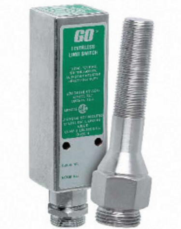
The magnetically driven TopWorx GO Switch from Emerson provides reliable proximity sensing in demanding and extreme conditions.

By automating and optimizing maintenance, as well as data collection and delivery, discrete valve controllers like this also enhance safety. Proactive maintenance and preset safety alerts and alarms reduce the frequency of maintenance rounds, while remote monitoring of valve package condition curtails the