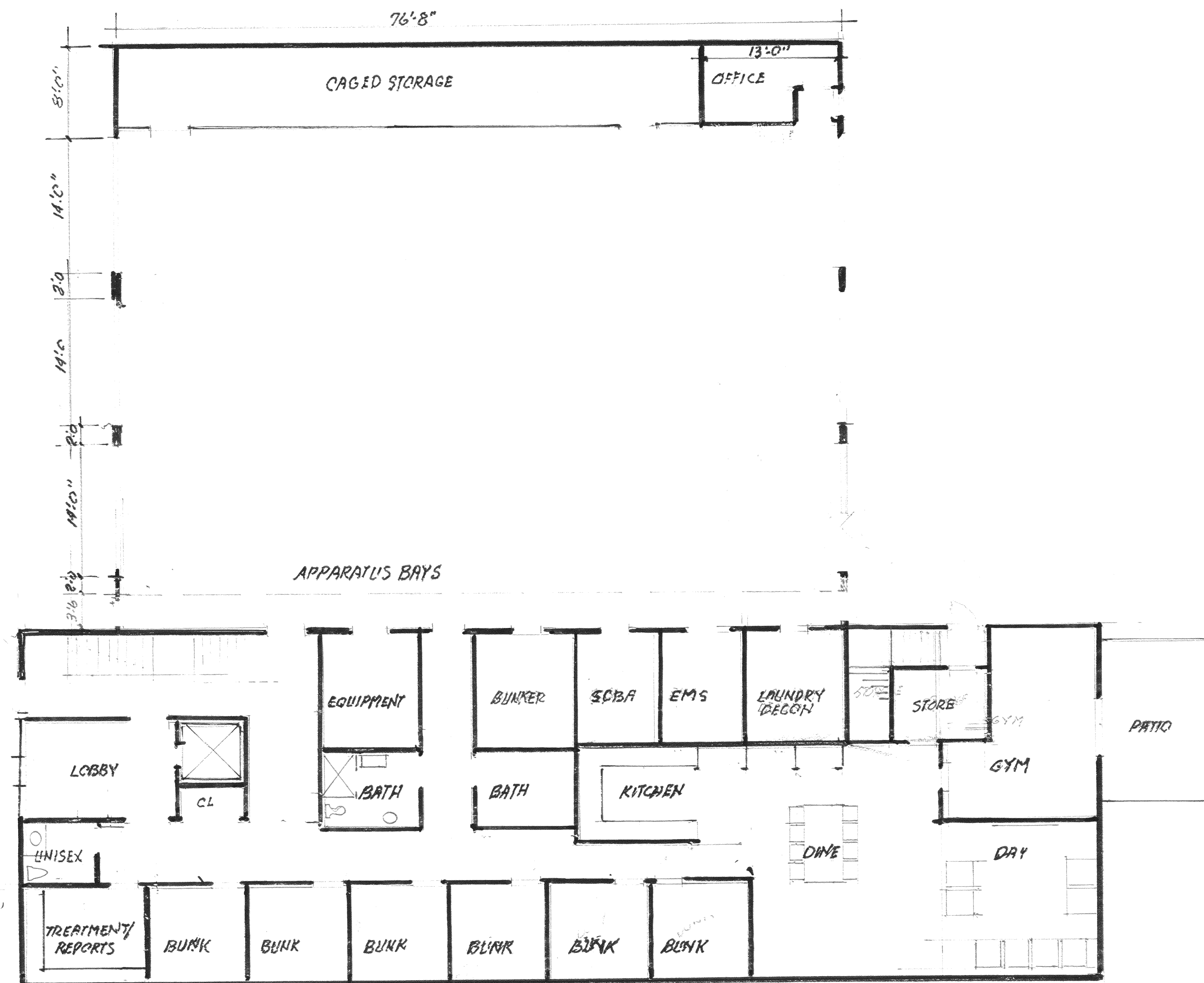
CONCEPT FLOOR PLAN 1/2"=1'-0" \frac{1}{8} "=1'-0" PINELLIS SUNGCAST FIRE STATION 28