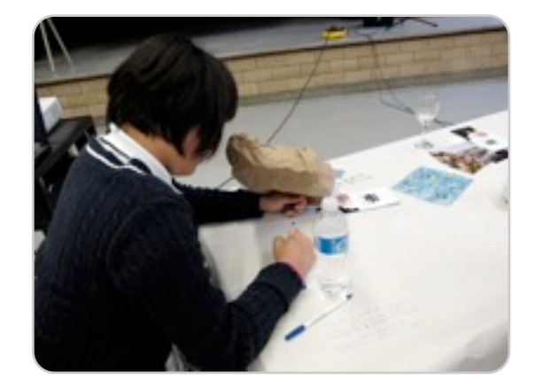
Shot 1: A high angle, over the shoulder medium shot (MS) of someone doing an activity.