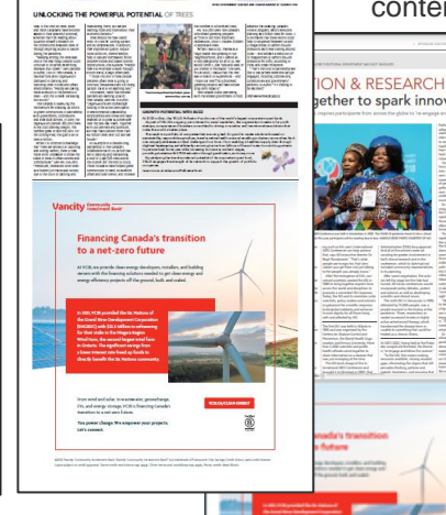
Digital Sponsor Content Custom developed with the client

Full sightlines in article with brand adjacent to report content