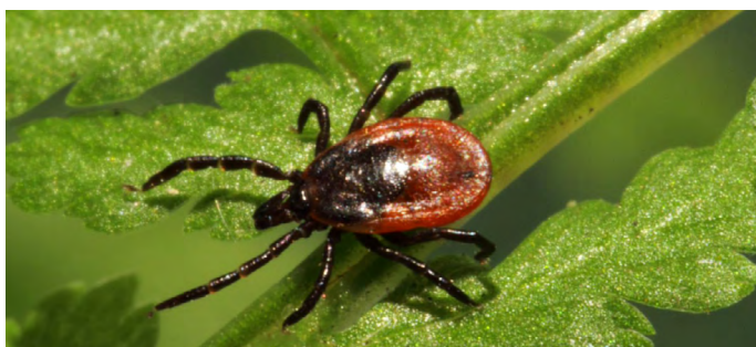
Ixodes ricinus .

After an increase in tick-borne encephalitis (TBE) was reported in Germany in 2020, possibly linked to increased tick densities, VectorNet held a rapid survey among its network on longitudinal observations on densities of the castor bean tick ( Ixodes ricinus ), the main vector of Lyme borreliosis and TBE. Overall, there was no evidence of European-wide increases in tick densities. While tick densities may have increased in some areas, tick density is only one risk factor of tick-borne diseases. Other risk factors, such as human exposure to ticks, may have changed in 2020 compared to previous years.