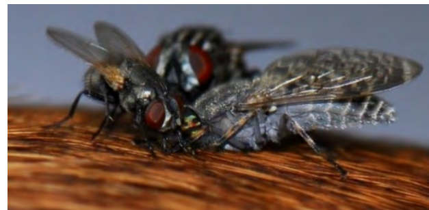
Mechanical vectors biting flies ( Haematopota sp. and Sarcophaga sp. ) feeding on a horse.