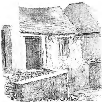
THE LENTHOLD HOUSE, MUSEUM FROM A DRAWING BY M. J. B. M. 1841