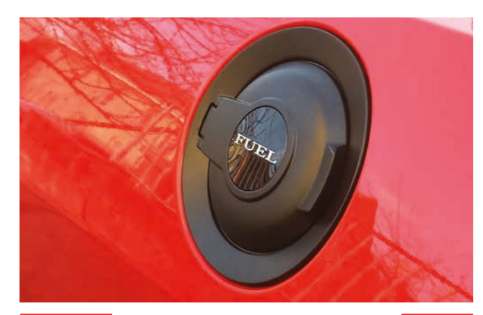
5MY11RXFAD FUEL DOOR BLACK

SET OF 2 FRONT: FROM MY 2015-2021 REAR: FROM MY 2011-2021