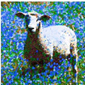
Illustration 3: "Pointillist painting of a sheep in a sunny field of blue flowers", image generated by DALL-E, 08.03.2023.